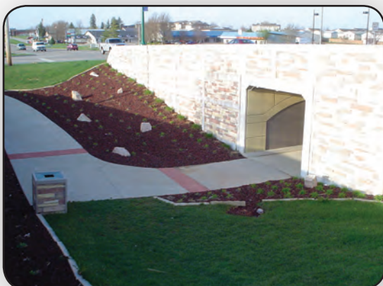
Underpasses are effective solutions, but expensive.

Trails can be expensive but provide great enjoyment to users of all ages. Multiple funding sources are available for trails, but demand and competition for funding is high.