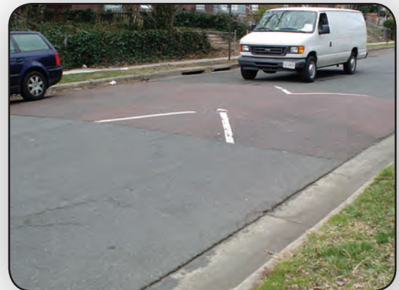
A speed hump is effective at reducing traffic speeds. Generally, speed humps are compatible with snow removal and truck traffic.

Communities are often resistant to the road diet concept, but after testing the configuration, many communities do not want to return to a four-lane configuration.