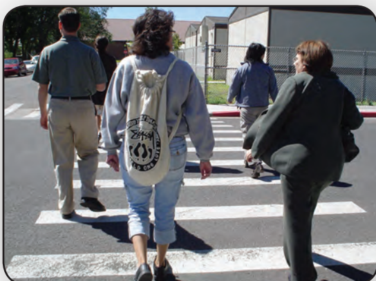
High visibility crosswalk markings create driver awareness.

Sidewalks that are close to the street and moving traffic are uncomfortable for for the pedestrian and can pose safety issues. Efforts should be made to provide a buffer between the street and sidewalk. In a historic commercial district, street furniture, amenities, landscaping, bicycle parking, and lighting can be used as long as it leaves pedestrians enough space. Depending on the area in the community, bike lanes, paved shoulders, parked cars, or grass can all serve as a buffer.