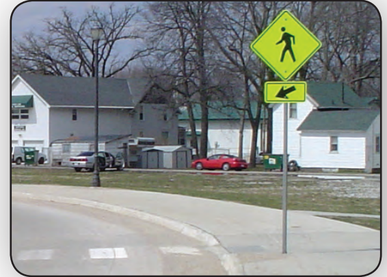
A high visibility crosswalk sign with arrow creates awareness for a crosswalk with heavy pedestrian traffic to the Oelwein downtown.

Bump-outs can be done with mid-block crosswalks. In addition to the shorter crosswalk, more visibility exists for the pedestrian. A bump-out is much better than requiring the pedestrian to cross between two parked cars.