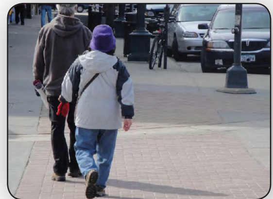
Many communities use unique surfaces, like brick, for a crossing. Be sure your crosswalk is visible to motorists.

Communities should establish programs that inspect sidewalks for repair or replacement annually. Sidewalk infill programs help prioritize how to phase in new sidewalks to be installed in areas where they are completely lacking.