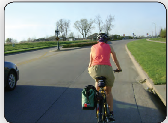
The motorist and bicyclist share the lane laterally in this wide outside lane in Coralville.