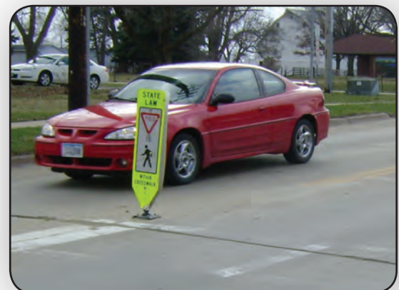
An in-street crosswalk sign can also slow traffic for critical pedestrian crossings.

Sometimes through-traffic is the program. Using a traffic diverter, automobiles can only make right turns or exit a street but not enter from the diverted location. This reduces the through-traffic to neighborhood traffic only. Automobiles are not prohibited, but they have to enter only through the diverted access. Diverters can accommodate bicyclists with pass-through areas.