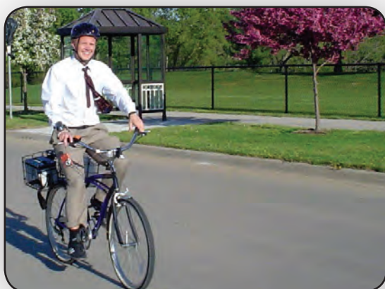
Iowa City bicyclist rides to work during Bike to Work Week.

Shop By Bike programs have been widely successful. Participants are encouraged to use their bicycles for shopping. If they make purchases at participating stores, they are given a card with a punch or stamp that documents the purchase. When the card is full, they can be turned in for prizes like community gift certificates. This type of program is very measurable and there may be grant funding to initiate.