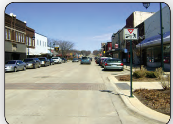
A bump-out in the Oelwein downtown area shortens the pedestrian crosswalk and narrows the traffic lane enough to slow cars.

Many communities have traffic signals at intersections. Most have a push button for pedestrian activation or some means to detect pedestrians present at the crosswalk. It is important that signals are adjusted to the current estimate of pedestrian speed of four feet per second. Activation should comply with the Americans with Disabilities Act (ADA).