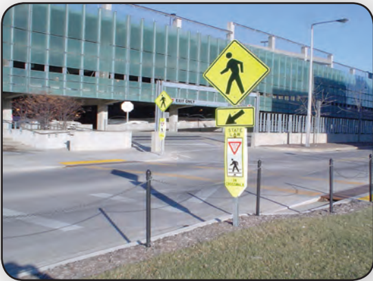
A raised pedestrian crosswalk on the University of Iowa campus.