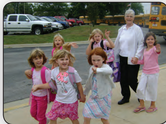
A walking school bus in Manly, Iowa.

can interact with their peers and gain exercise. Free workshops are available from the Iowa Bicycle Coalition and can help establish a community Safe Routes to School program. The Iowa DOT offers competitive grants to established local programs to implement improvements such as sidewalks and educational programs.