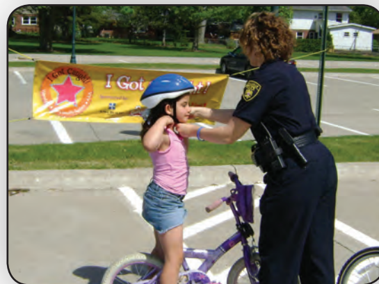
A police officer helps with a bike rodeo in Coralville, Iowa.