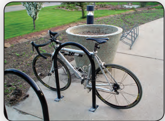
The Inverted U bike rack is effective for short-term bike parking.

Bicyclists prefer to secure the front wheel and frame of their bike to the bicycle parking rack. The Inverted U-type bicycle rack is generally acceptable for this purpose. The Inverted U is bolted or cemented into the pavement. The Inverted U rack may be mounted on rails so it can be moved for snow removal.