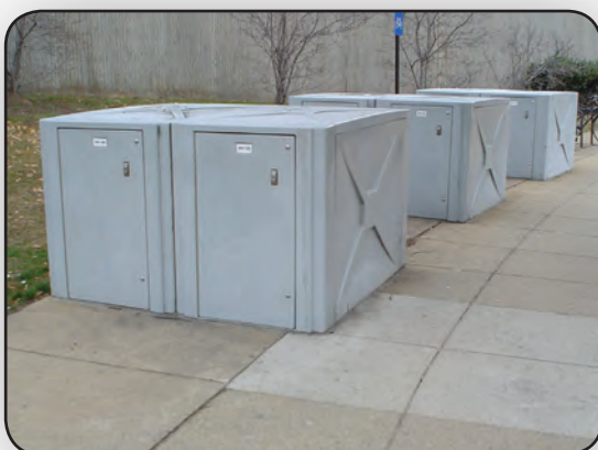
A bike locker can be beneficial to persons living downtown with limited storage.

A bike locker can facilitate long-term storage. This is especially useful in downtown living situations where you cannot store your bicycle inside. A bicycle locker is a a keyed or coin-operated storage facility that protects bicycles from weather and provides additional security for long-term storage.