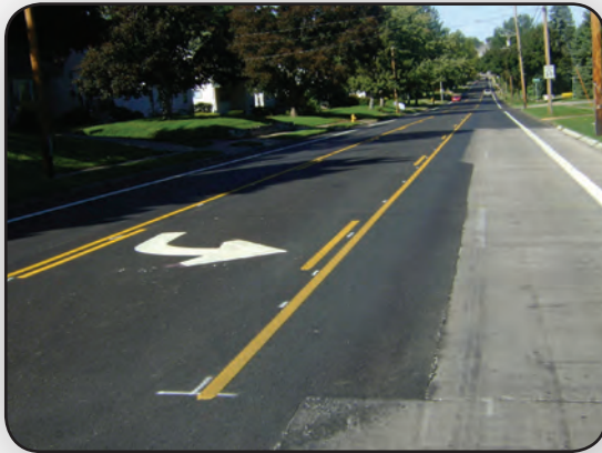
Davenport reconfigured a four-lane road to a three-lane road diet. The center turn lane helps reduce collisions. The remaining space is used for bike lanes.

A road diet converts an existing four-lane roadway into a three-lane roadway. There is a lane of traffic for each direction and a two-way, center turn lane for left-turning traffic. Often, there is space leftover for a paved shoulder or bike lane.