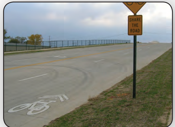
A sharrow is placed along 33rd Avenue in Cedar Rapids as part of a complete streets component to the street upgrade.