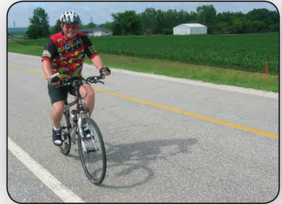
A bicyclist shares the lane of traffic with other motor vehicles on the Mississippi River Trail near Wapello.

Sharrows are generally placed 4' from the curb or 11' from the curb if on-street parking exists. These distances are a minimum and sharrows may be placed closer to the centerline if warranted.