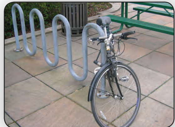
The wave rack is common. There are issues with bikes occupying more than one space or not holding the bike by the frame.

The Wave-type bicycle rack is common. Bicyclists have a more difficult time understanding how to lock their bicycle to this type of rack. If bicyclists don't use the rack as intended, the capacity may be much lower than planned.