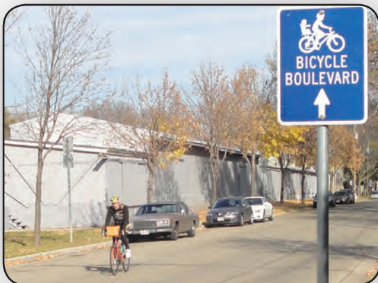
A low-traffic residential street has been converted to a bicycle boulevard.

Bike lanes should be dashed or signed if ending or if traffic will merge through the bike lane to access a turning lane. Bike lanes do not provide protection for cyclists, and people should be on the lookout for bicyclists and automobiles. Bike lanes should only be one-way facilities following the flow of traffic and should be placed on the right side of the roadway between parked vehicles and moving traffic. Consult the Manual For Uniform Traffic Control Devices (MUTCD) for more information on the installation of bike lanes.