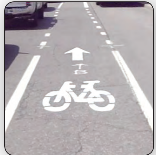
A newly installed bike lane on Ingersoll Avenue in Des Moines. The city has adopted a complete streets policy and working to incorporate elements in road projects.

Complete streets do not prescribe “one size fits all” facilities. A complete street in a neighborhood may require sidewalks and shared roadway bicycle facilities. A complete street along a highway may require a separated trail. It is up to community leaders to apply the latest and best design standards to safely serve bicyclists and pedestrians.