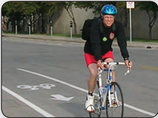
A bike lane in use in Des Moines.