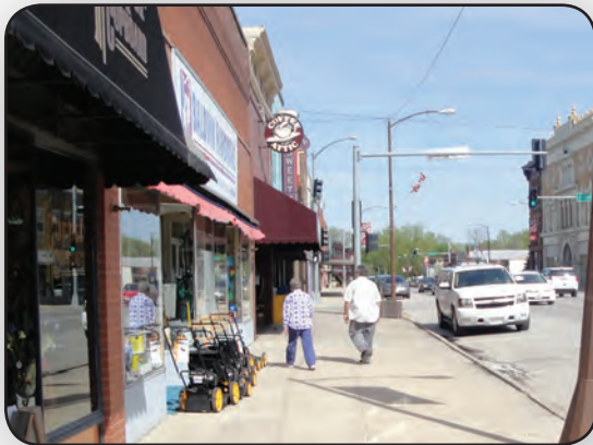
Wide sidewalks are essential elements for downtown streets.

Walking to and through the historic commercial district's destinations should be both comfortable and safe while traveling between destinations. In the wintertime, programs are needed to ensure property owners clear snow and ice to reduce liability and increase use of sidewalks.